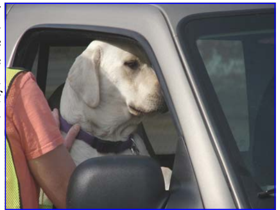
Even Man's Best Friend is concerned about our environment.

A hearty thanks to all in Goodwill's transportation department and Goodwill staff who worked the event. You all performed like the professionals you are and you all contributed to the great success of Goodwill's E-Waste Recycling program.