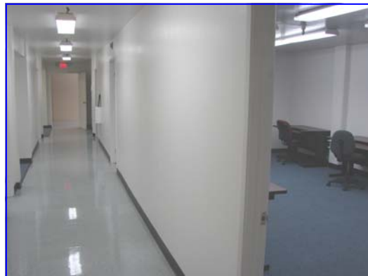
New staff office areas, graphic display work-space, and expanded production area are some of the new features of Goodwill's on-line shopping bazaar.