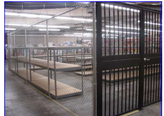
ShopGoodwill's new home includes an enclosed area for items to be sold on-line.