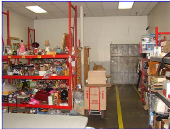
ShopGoodwill's old working space.